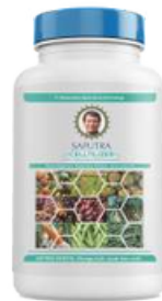
CELLTILIZER GENERATIVE (OPTIMIZING GENERATIVE PERFORMANCE)