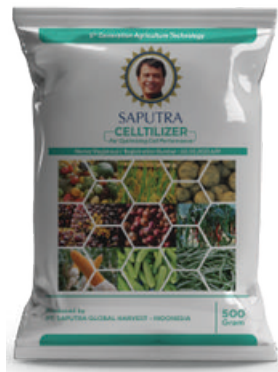
CELLTILIZER VEGETATIVE (OPTIMIZING GROWTH PERFORMANCE)

CELLTILIZER is the complete essential nutrients fertilizer enriched with macro, micro and trace elements, which function to optimize the performance of plant cells and improve the fulfillment of soil and plant needs