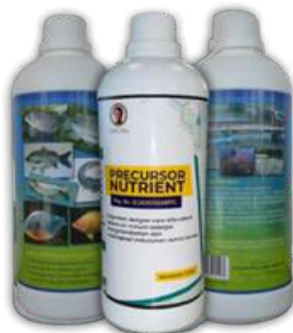
PRECURSOR NUTRIENT FOR FISHERIES