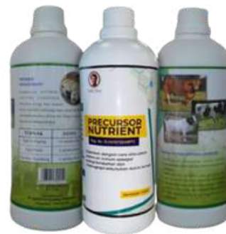
PRECURSOR NUTRIENT FOR LIVESTOCK