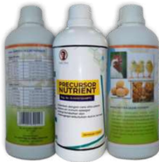
PRECURSOR NUTRIENT FOR POULTRY

SAPUTRA PRECURSOR NUTRIENT is the complete essential nutrients which function to optimize the performance of animal cells and improve the fulfilment of animal needs